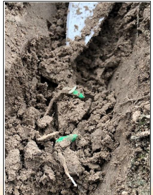
RT7321 FP Pipping in Southeast Louisiana

Tuesday (3/23) thunderstorms halted planting progress throughout the region with some areas receiving over 4" of rain. The previous cold front slowed rice movement in the field but overall, the crop is off to a good start. Two RFYT (Replicated Field Yield Trials) trials are planned to go in as soon as the ground dries, as well as several Max-Ace™ demo fields. Stay tuned as we will announce meetings and field tours at our trial locations later in the season.