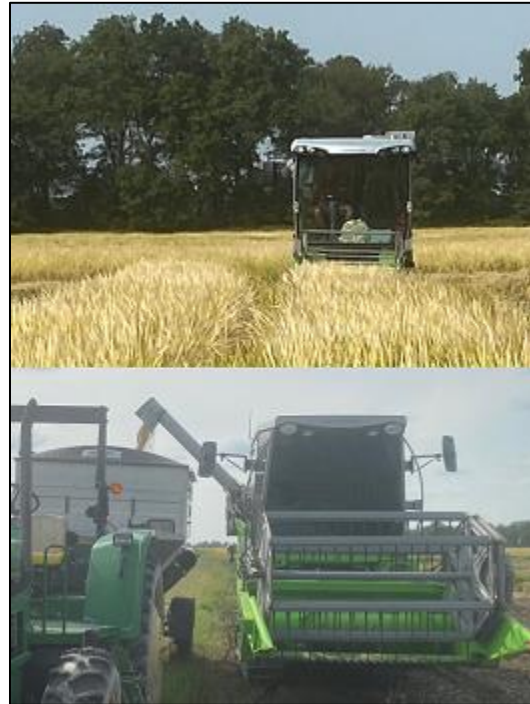
RiceTec Plot Harvest Harrisburg, AR

As we move into Northeast Louisiana our rice is about 85% harvested. Grain yields are holding at 190-200-bu/ac on RiceTec hybrids. On the herbicide tolerant side, we have received many positive comments on RT7521 FP on excellent yields and ease of harvest. We finished harvest on our Farm Scale Yield Trials in the district, and the yield comparison with competitors is impressive. I would be glad to visit with you on the results.