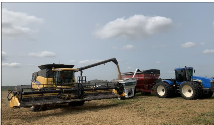
RFYT Harvest Stuttgart

There are only a handful of late planted fields remaining to be cut before we can say we are 100% done with first crop harvest in this part of the Region. Our main crop yields were some of the strongest we have ever seen, and we eagerly anticipate a strong ratoon harvest in mid to late October. All nine of our Farm Scale Yield Trials have been harvested here along the coast. We will be harvesting the ratoon crop on most of them as well. With stubble manipulation and improved fertility management on the ratoon crop, it is not out of the ordinary for some folks to harvest 40-50% of their main crop yield.