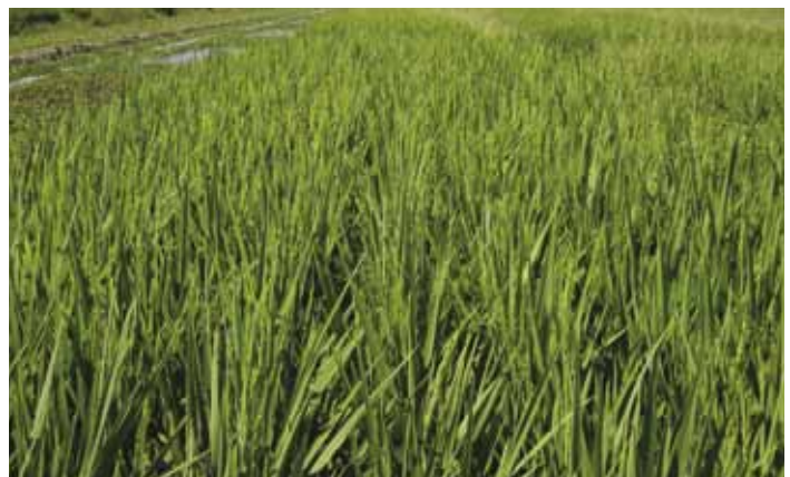
Clearpath (0.5 lb/A) followed by Newpath (4 oz/A)